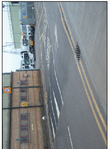
PHOTO OF SINUSOIDAL ROAD HUMP INSTALLED AT THE RECYCLING CENTER IN AMENITY WAY – MORDEN